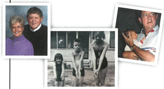
Photo gallery of up to 25 pictures that cherish important moments, family and friends

Funeral and visitation information, including times and locations