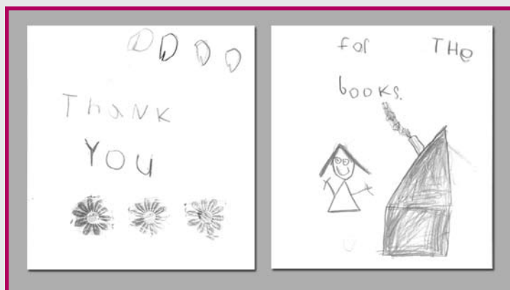
Pictured above: A thank you note from one of the children who received books from our book drive.

Thank you to everyone who helped make the book drive for Jefferson School a great success! Over 1,800 books were collected from your donations, which allowed each child to select three books to take home. We look forward to making this an ongoing part of our Thanksgiving Meals-on-Wheels event.