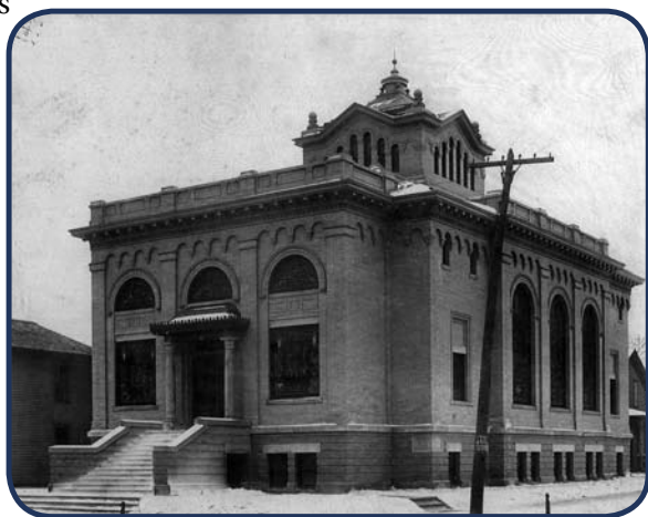
Former location of both Temple Israel and the Hodroff Funeral Home